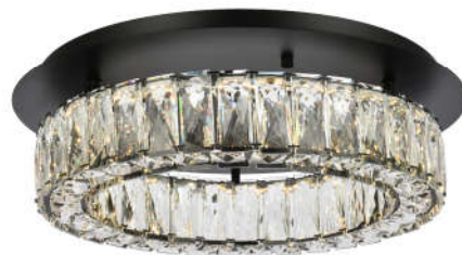
Black Item No:3503F18BK