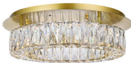
Gold Item No:3503F18G